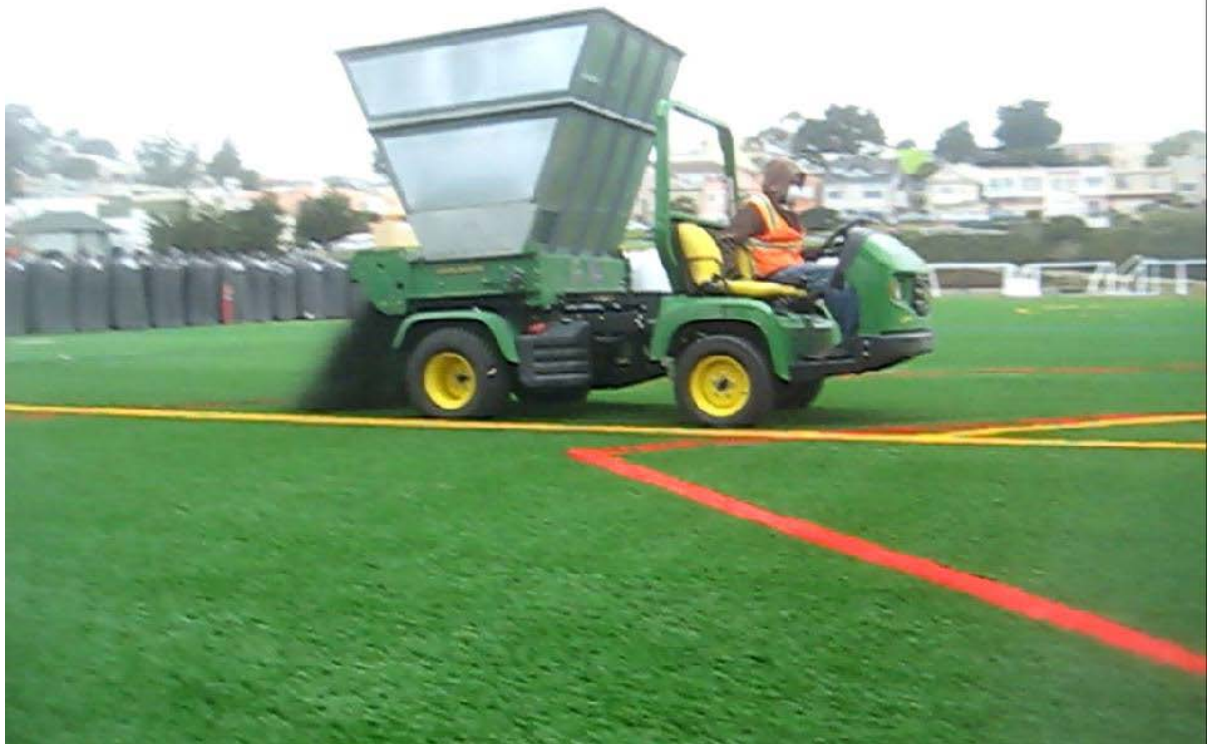
Figure 3.2 Semi-mechanised application of infill

This is normally done by one or two units per field. Big-bags are unloaded directly in the cargo bed of the truck, however if problems arise, workers can break the sacks manually. The infill is then brushed into the carpet using another tractor. Manual raking might occur as well.