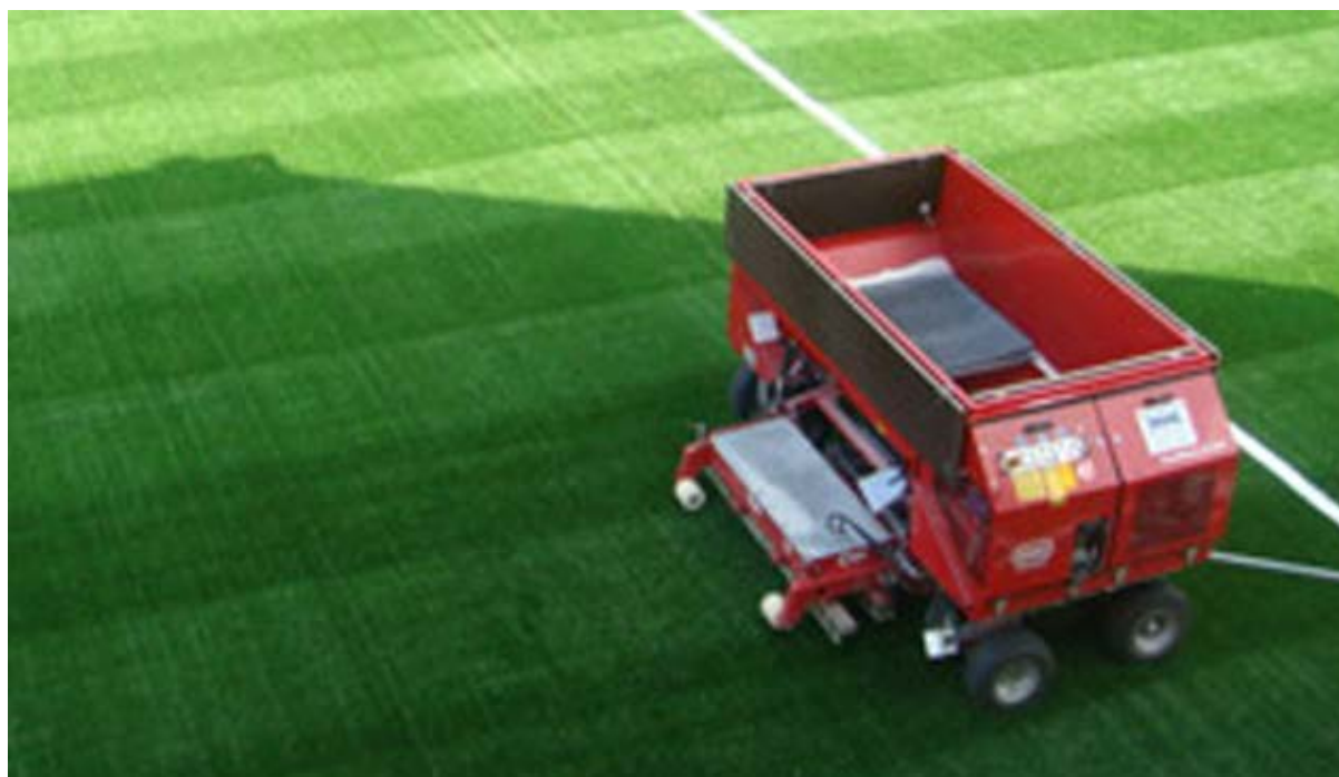
Figure 3.1 Mechanised application of infill

According to the ESTO (2016), the procedures used to install the infill vary depending on the country and contractor. Larger companies will use machines to distribute the infill and brush into the synthetic turf carpet (see Figure 3.1).