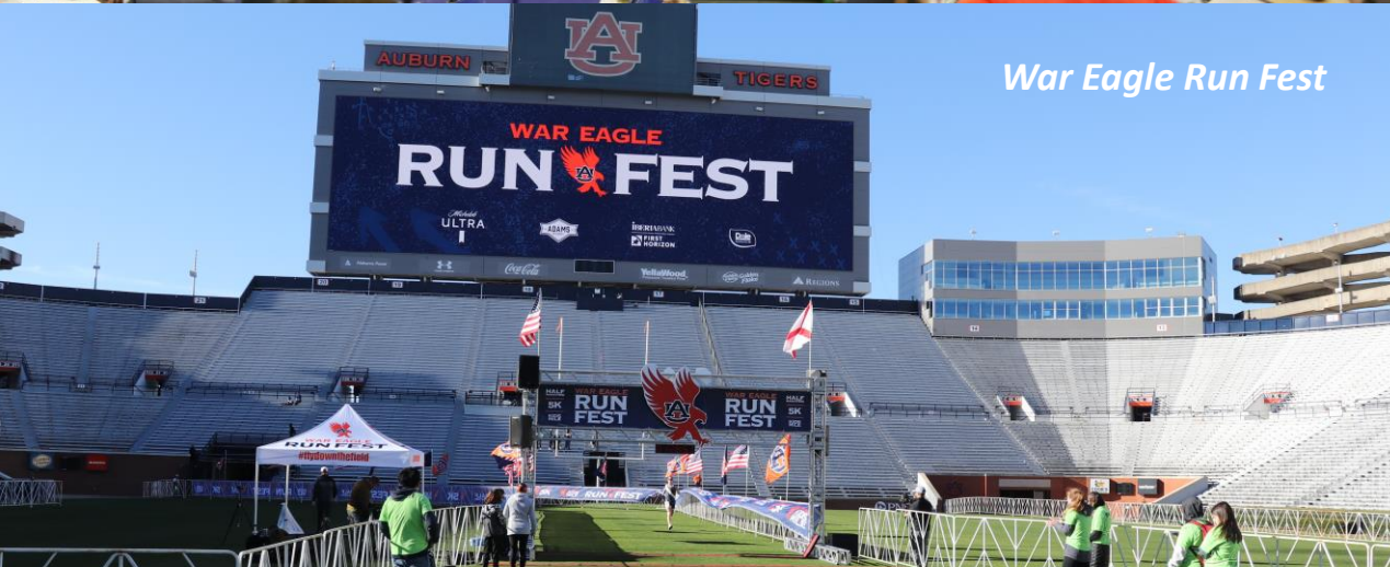
War Eagle Run Fest