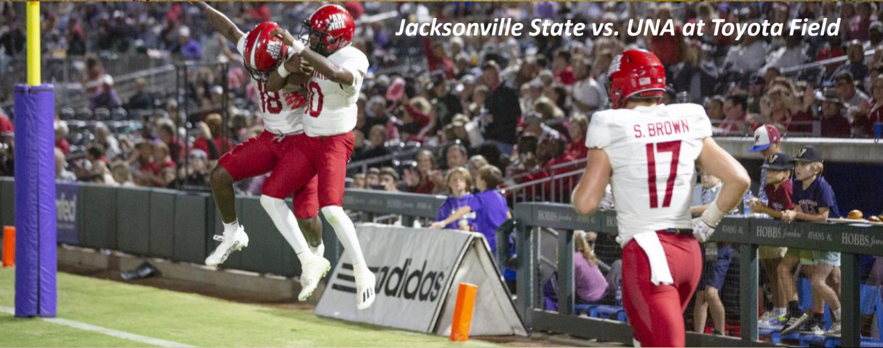
Jacksonville State vs. UNA at Toyota Field