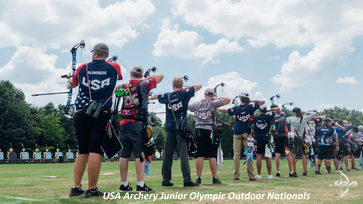
USA Archery Junior Olympic Outdoor Nationals