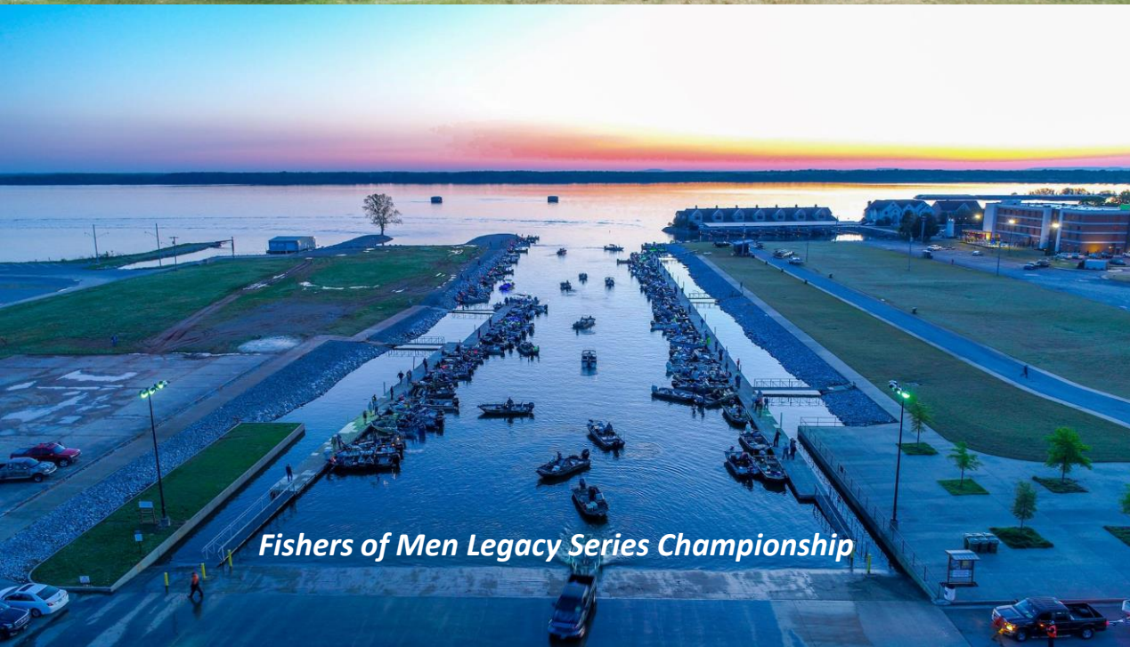
Fishers of Men Legacy Series Championship