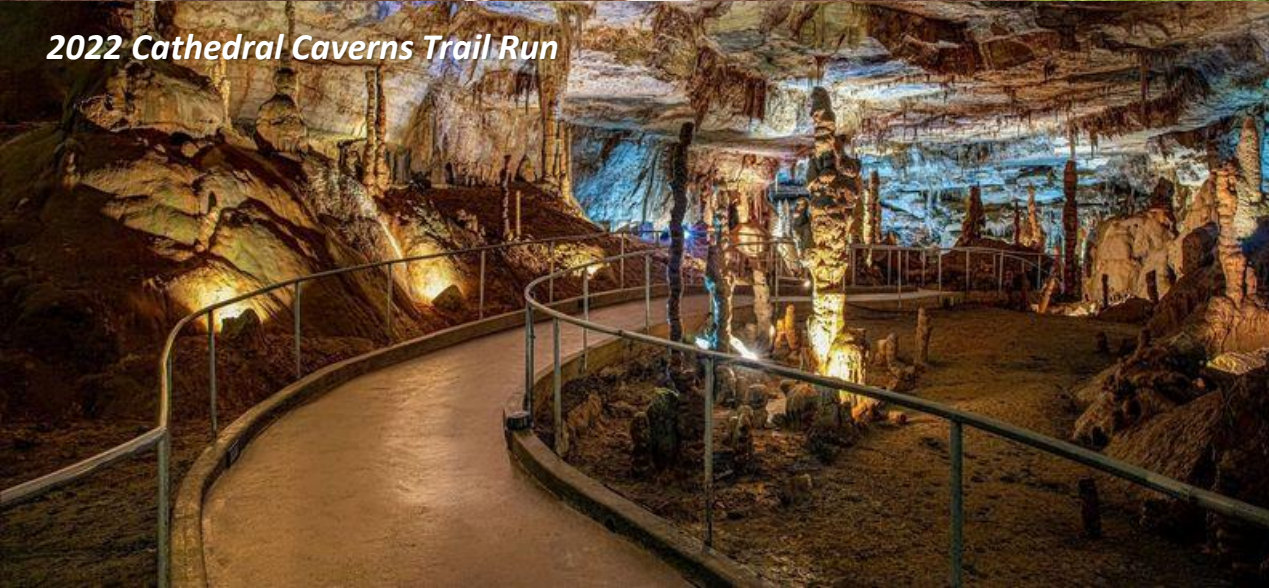
2022 Cathedral Caverns Trail Run