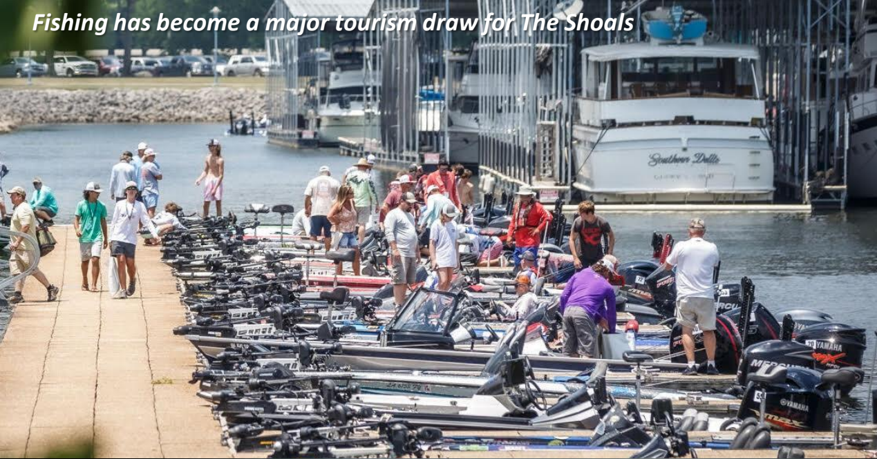
Collegiate National Championship

Fishing has become a major tourism draw for The Shoals