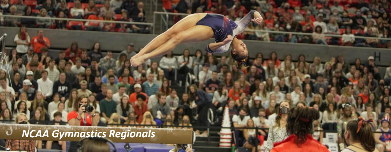
NCAA Gymnastics Regionals