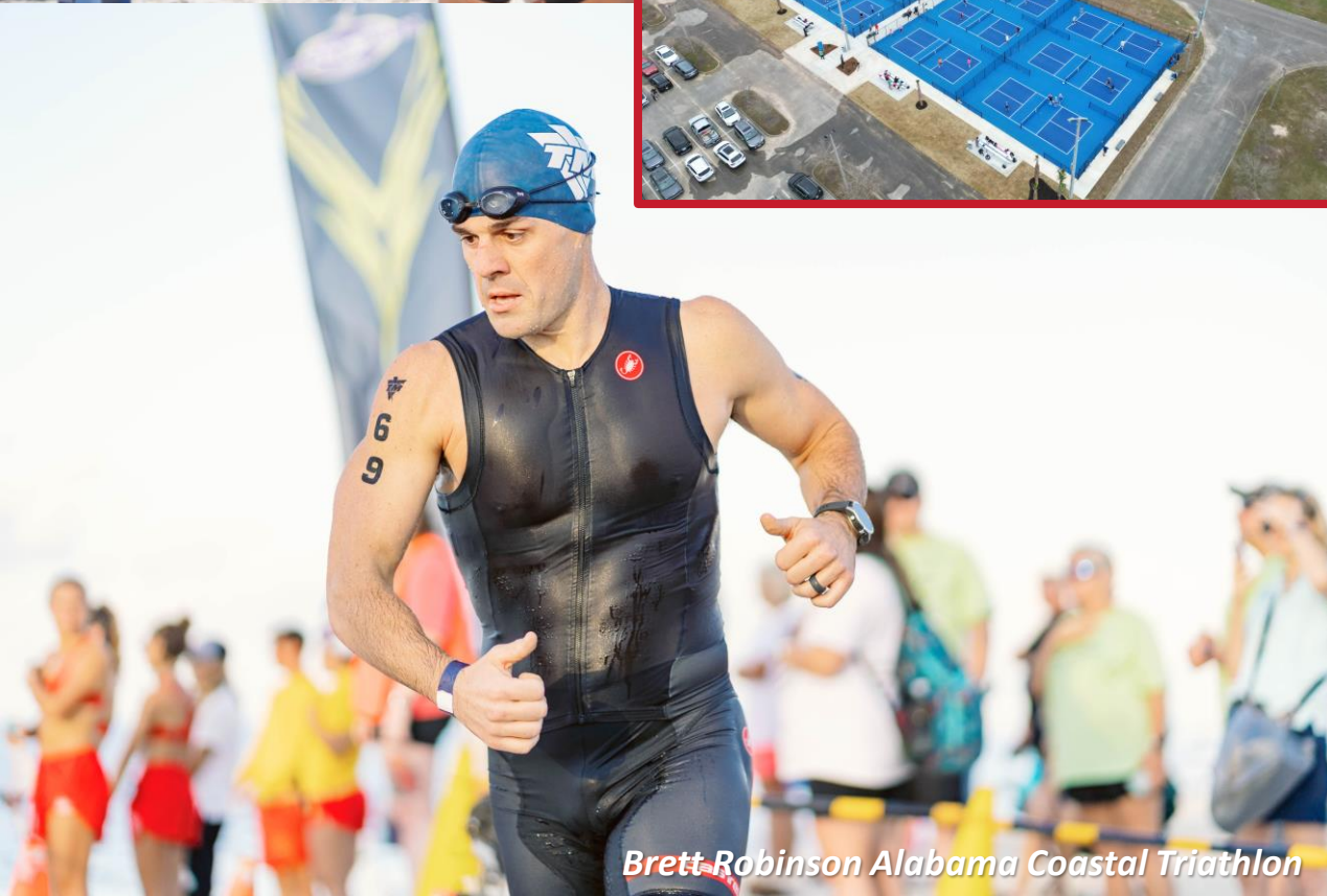
Brett Robinson Alabama Coastal Triathlon