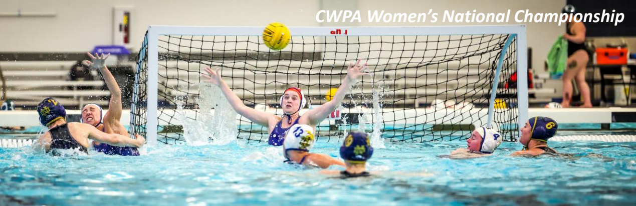
CWPA Women's National Championship