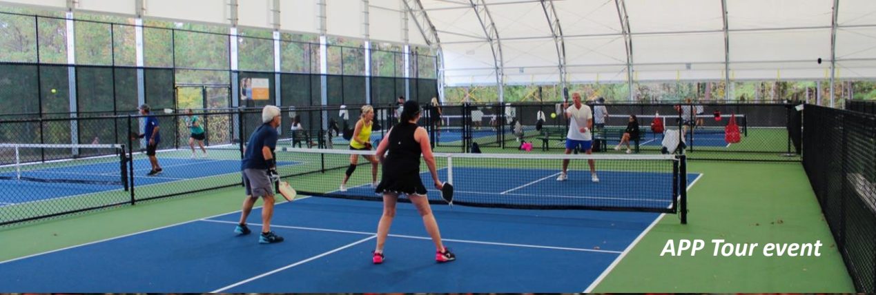
APP Tour event