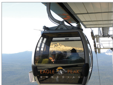
Diamond Peak View

The area's largest city, Eugene, is known as Track Town USA. Miles of running, cycling and hiking trails are just steps from central convention hotels, meeting venues and award-winning regional restaurants. The Willamette River winds through downtown with easy accessibility for rafting, kayaking, fishing or riverfront picnics. Hop in a pedicab to visit historic Hayward Field at the University of Oregon, birthplace of Nike.