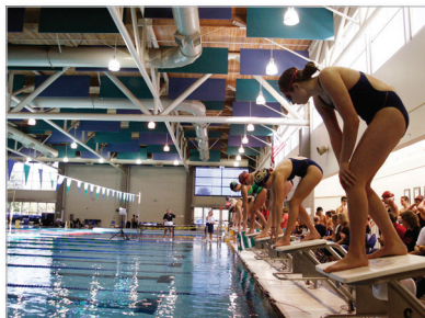
Willamalane Swim Club