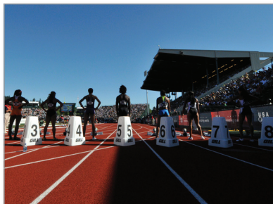
Eugene 08