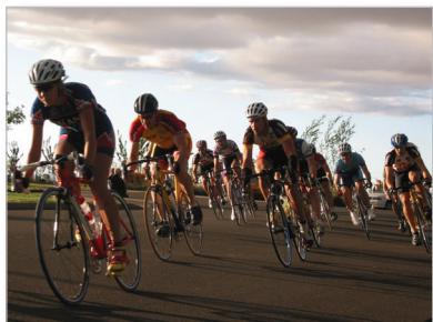
Twilight Criterium

Savor Eugene, Cascades & Coast! Soak up the Northwest's laid-back culture with stress-free transportation, affordable adventures, plentiful entertainment and authentic experiences.