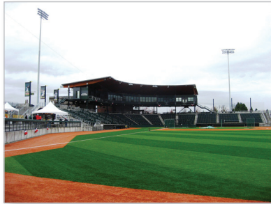
PK Park Eugene, Oregon

Steeped in sports tradition and excellence, we offer multipurpose indoor and outdoor venues, turf and grass fields, and natural outdoor venues with enough flexibility to support most events. Ample, friendly and affordable hotel options, no sales tax and strong local support for all sports makes us the perfect sports destination!