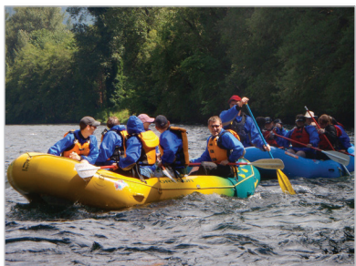
Rafting the McKenzie River

Wow your participants with a one-of-a-kind "Dinner in the Sky" event. After ski season, Willamette Pass Ski Resort converts a fully ADA accessible gondola operation into a moving dining room. On top of Eagle Peak enjoy panoramic mountain views while feasting on regional specialties. Winter sports like snowshoeing, snowboarding, skiing and sledding make great event excursions and pre / post activities.