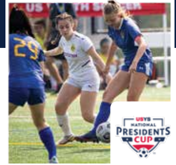
2023 US Youth Soccer Eastern Presidents Cup