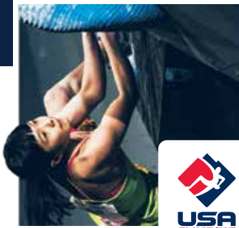
2019 USA Climbing Sport & Speed Youth National Championships