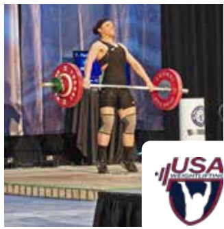
2018 USA Weightlifting American Open Series 2