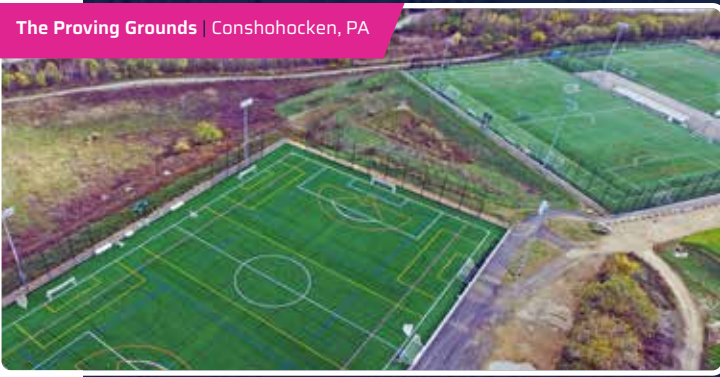
The Proving Grounds | Conshohocken, PA