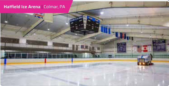
Hatfield Ice Arena | Colmar, PA