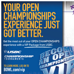
Direct Mail Advertising