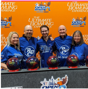
2021 Las Vegas