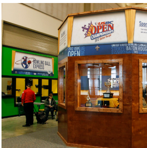
Indoor Tournament Signage