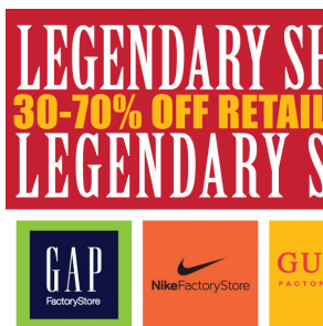
Local Business Advertising