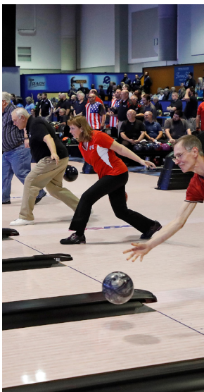
2018 Syracuse, N.Y.

Bowlers compete in three events – team, doubles and singles; in three skill-based categories – Regular Division (176 average and above), Standard Division (156 to 175 average) and Classified Division (155 average and below). Each event consists of three games. Entry fees are $70 per event per bowler plus $15 for optional all-events ($1,125 total for the entire team), creating a prize fund greater than $6.1M.