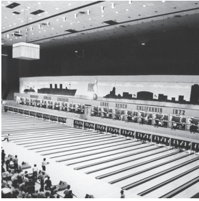
1972 Long Beach, Calif.