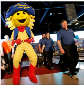
2015 El Paso, Texas

A hosting community can expect to realize $75 million in local economic impact.