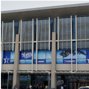
Outdoor Tournament Signage