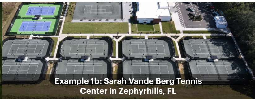
Example 1b: Sarah Vande Berg Tennis Center in Zephyrhills, FL