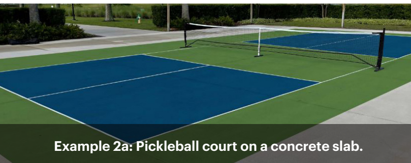
Example 2a: Pickleball court on a concrete slab.

In the event that sport-specific sites are not possible, both tennis and pickleball can be played and enjoyed in non-traditional spaces. Look at all hard surface areas for possible conversion, such as a concrete slab (Example 2a), multi-sport court sites (Example 2b) and/or vacant parking lot locations. When contemplating any type of conversion affiliated with public facility infrastructure, safety must be at the forefront of all considerations. Further, local ordinances should be reviewed to ensure accessing the space for play is allowed.