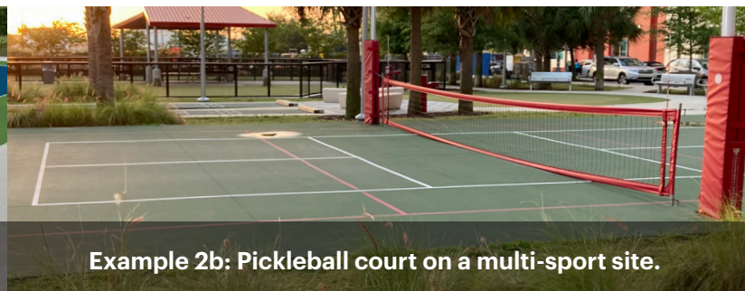
Example 2b: Pickleball court on a multi-sport site.