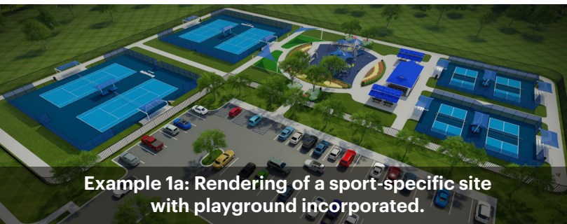
Example 1a: Rendering of a sport-specific site with playground incorporated.

The ideal solution is the development and/or expansion of sport-specific public sites. Singular-focused sport-specific sites and courts will provide optimum opportunity for use, harmony, and program/revenue generation for each sport that may be unavailable in shared-use scenarios. These facilities should be offered either as one central facility complex or as separate sport-specific developments to best meet the needs of the community. The ultimate goal is to ensure both sports have the infrastructure in place to maintain existing programs and play as well as allow for future growth (Examples 1a & 1b).