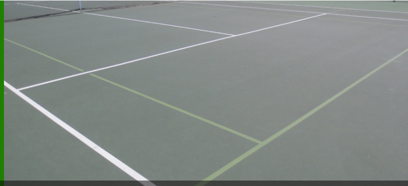
Example 3b: Blended lines in the same color family as the playing surface.

For additional information or to discuss projects before decisions are made regarding tennis and pickleball expansion and additions, contact the USTA Tennis Venue Services Team for complementary consultative resources at www.usta.com/facilities or email Facilities@usta.com .